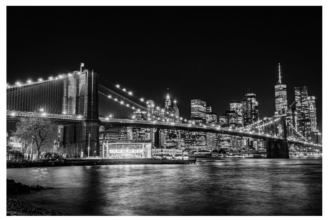
HM: "New York" By Goutam Sen